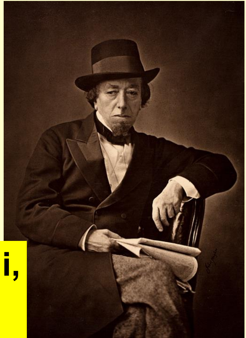
Benjamin Disraeli, Jewish prime minister