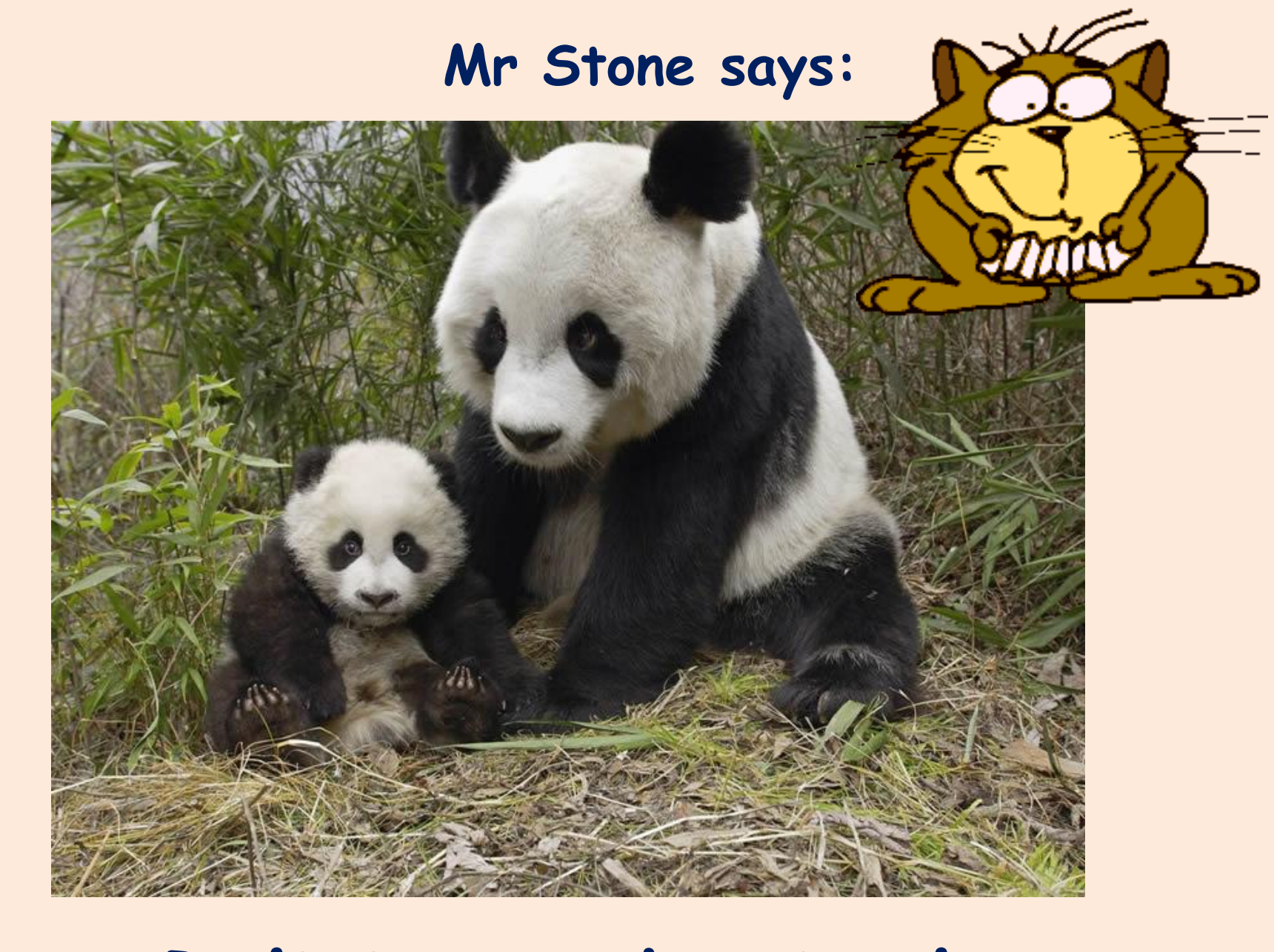
Religion and animals