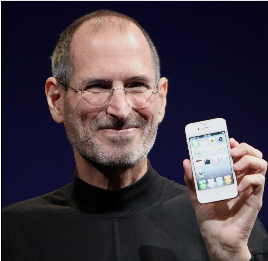
Steve Jobs , who invented the iPhone, was a Buddhist.