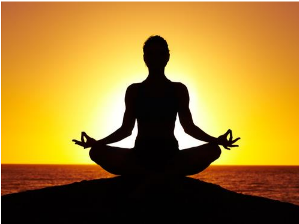
Buddhists often meditate .